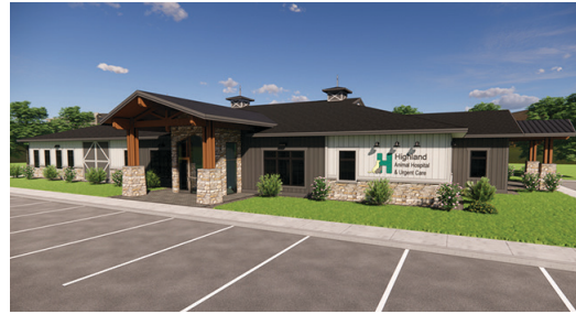
Highland Animal Hospital