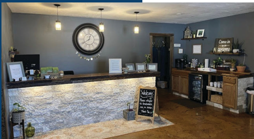
Eir Healing & Wellness